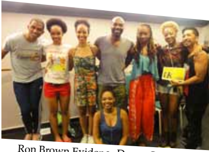
Ron Brown Evidence Dance Company at the Joyce Theater. In post concert Q&A with YDC.