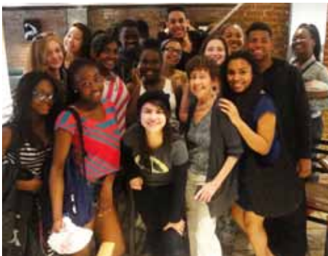
Supper at the "Dish" restaurant after Joyce concert